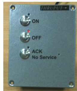
Left: The MIDAS hardware is a rack mount unit that fits in the ATC console. The photograph shows its dual redundant power supplies and universally standard video interfaces. Right: MIDAS clutter reduction indicator panel.