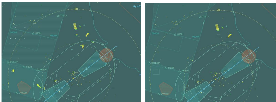
Areas of radar clutter (4 due to wind farms and 3 due to road traffic). Left: Before clutter reduction and Right: After clutter reduction.

Thruput Limited operates a policy of continuous improvement and information in this document is subject to change without notice.