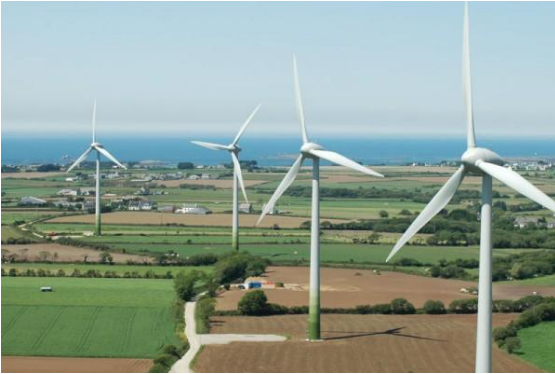
The moving blades of a wind turbine can cause interference to Air Traffic Control Radar.

Many Civil and Military airports are equipped with Primary Surveillance Radars to safely manage their air traffic movements and provide radar navigation services to pilots. An essential tool in ensuring air transport safety, these radars are particularly adept at the detection and tracking of moving targets.