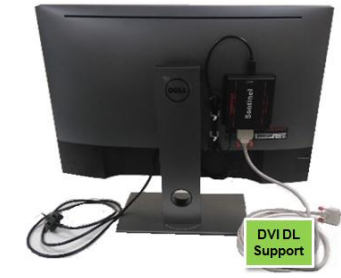
The GF VT 08 is available in free standing, VESA wall mount and custom panel mount versions.